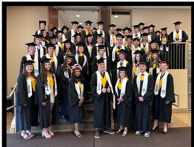
2024 SHSM Graduates

Once your child has completed the certification, s/he/they TAKE A SCREENSHOT of the final completion page and submit it on the Self-Reporting Google Form .