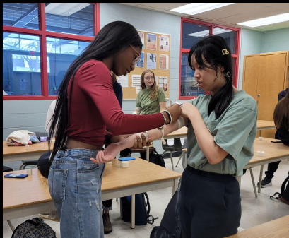
2024 Wrapping and Taping for Performance and Sport injury (Health and Wellness and Arts and Culture SHSM)

SHSM STUDENTS SHOULD CROSS CHECK the SHSM PATHWAY CHARTS to ensure they request SHSM eligible courses